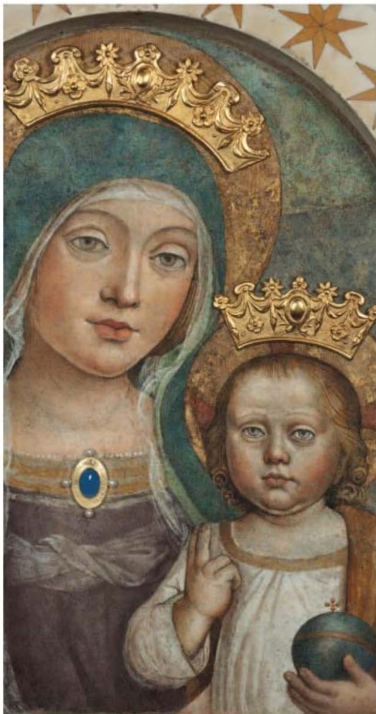
The ancient fresco of Madonna del Soccorso (Our Lady of Help) in St. Peter's Basilica was restored with the support of the Knights of Columbus to mark the Year of Faith (2012-2013).

O Mary, you always brighten our path as a sign of salvation and of hope. We entrust ourselves to you, Health of the Sick, who, at the Cross, took part in Jesus' pain while remaining steadfast in faith. O loving Mother, you know what we need, and we are confident you will provide for us as at Cana in Galilee. Intercede for us with your Son Jesus, the Divine Physician, for those who have fallen ill, for those who are vulnerable, and for those who have died. Intercede also for those charged with protecting the health and safety of others and for those who are tending to the sick and seeking a cure. Help us, O Mother of Divine Love, to conform to the will of the Father and to do as we are told by Jesus, who took upon himself our sufferings and carried our sorrows, so as to lead us, through the Cross, to the glory of the Resurrection. Amen.