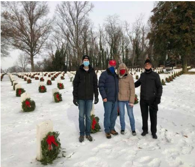
St Joseph Assembly #3502 Garrison Forest Veterans Cemetery Owings Mills, MD