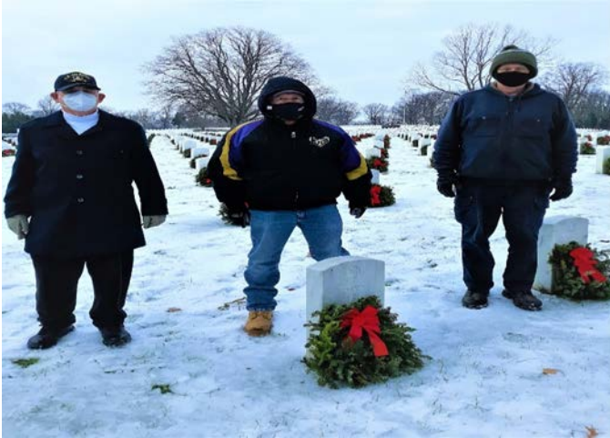
St Joseph Assembly #3502 Baltimore National Cemetery

program. Through our partnership and support from approximately fifty total donors to include assemblies, councils, and individuals, we were able to increase our contribution of wreaths from 350 in 2019 to over 400 this year which was included the total number of 5,051 wreaths laid at Baltimore National Cemetery.