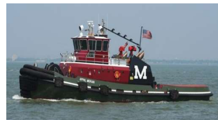
Moran Towing at Pier 13