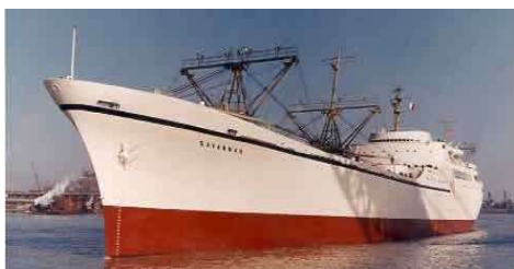
NS SAVANNAH at Pier 13

Our all-volunteer crew looks forward to welcoming YOU aboard!