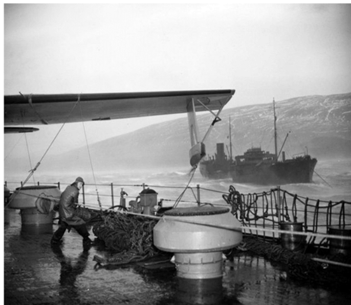
Heavy weather operations by Task Force 99 in the North Atlantic near Iceland during 1941. The crew of a seaplane tender struggling to secure seaplanes during a storm off the coast of Hvalfjörður, Iceland.

As a result of the typhoon, the Pacific Fleet established new weather stations in the Caroline Islands, Manila, Iwo Jima, and Okinawa. To coordinate weather data, weather central offices were established at Guam and Leyte.